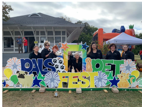
PetFest gave us a chance to sing with our pets and meet new people.